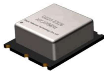
SMD Stratum 2 OCXO